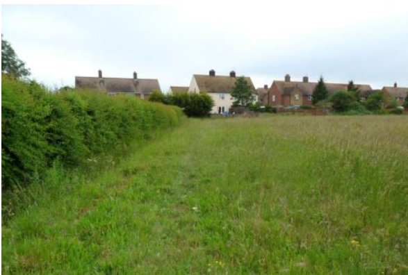
Possible site for affordable housing