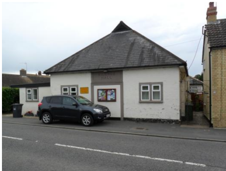
The current village hall site

Parish (or Community-Led) Plans create a shared vision for how the community wants to develop, and identify the action needed to achieve it. They provide a way for you to have your say on all aspects of life in your community, whether environmental, social, economic or cultural. These needs and aspirations are then translated into an action plan showing who, how and by when these priorities will be tackled.