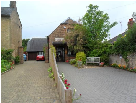
The current GP surgery premises